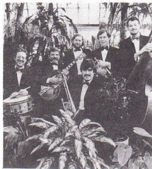
Paradise City Jazz Band