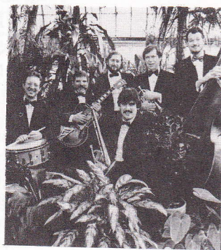
Paradise City Jazz Band