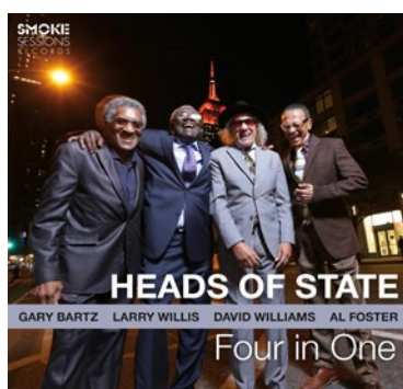
2017 - Heads of State Super-group