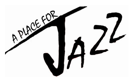
PO Box 1059, Schenectady NY 12301 Membership is Where It's At!