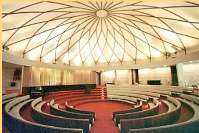
First Unitarian Society of Schenectady 1221 Wendell Ave - The Whisperdome