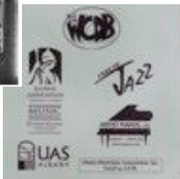
Sponsorship credits for the 25th anniversary of Bill McCann's WADB Jazz radio show.

Albany Riverfront Jazz Festival (2008 - 2010)