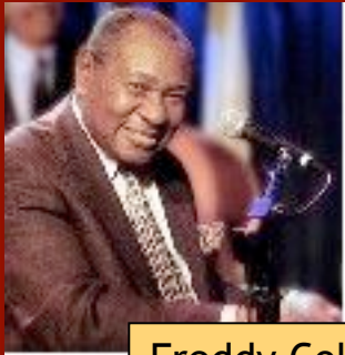
Freddy Cole (2011)