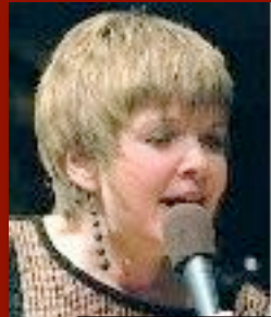
Karrin Allyson (2008)