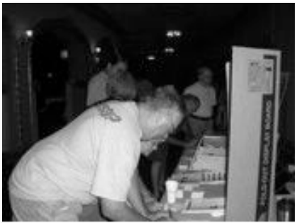
Albany Jazz Festival fans join APFJ's e-mail list at their sponsorship table.