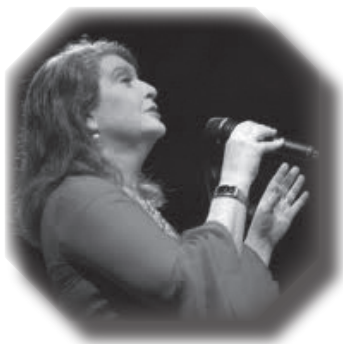
Songstress Judi Silvano