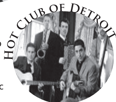
HOT CLUB OF DETROIT